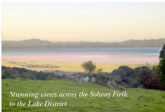
Stunning views across the Solway Firth to the Lake District

Why not stay in a secluded cabin on a family run farm where you can re-learn the freedom of country life? The perfect get-away for those seeking a return to the great outdoors with a myriad of activities on the doorstep. From mountain biking on competition standard forest trails, to beach combing, bird watching and historical discoveries there's a host of activities for all the family. Whatever you want from your holiday, an adventure or a rest, you can find it at Oakwood Lodge – the choice is yours.