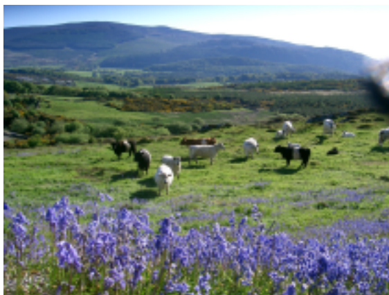
Galloway Cattle on the hill

Free range eggs, asparagus, strawberries and new potatoes are available from the farm when in season.