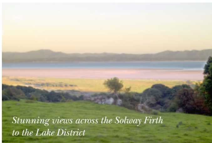
Stunning views across the Solway Firth to the Lake District

Why not stay in a secluded cabin on a family run farm where you can re-learn the freedom of country life? The perfect get-away for those seeking a return to the great outdoors with a myriad of activities on the doorstep. From mountain biking on competition standard forest trails, to beach combing, bird watching and historical discoveries there's a host of activities for all the family. Whatever you want from your holiday, an adventure or a rest, you can find it at Oakwood Lodge – the choice is yours.